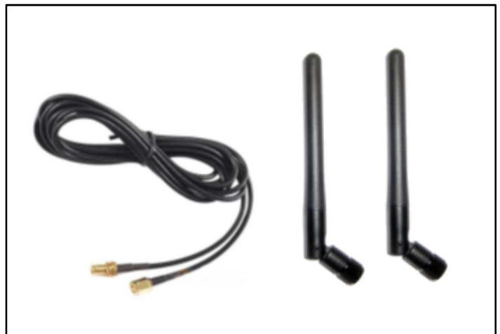
Standard Antenna/Cable Set Included with System