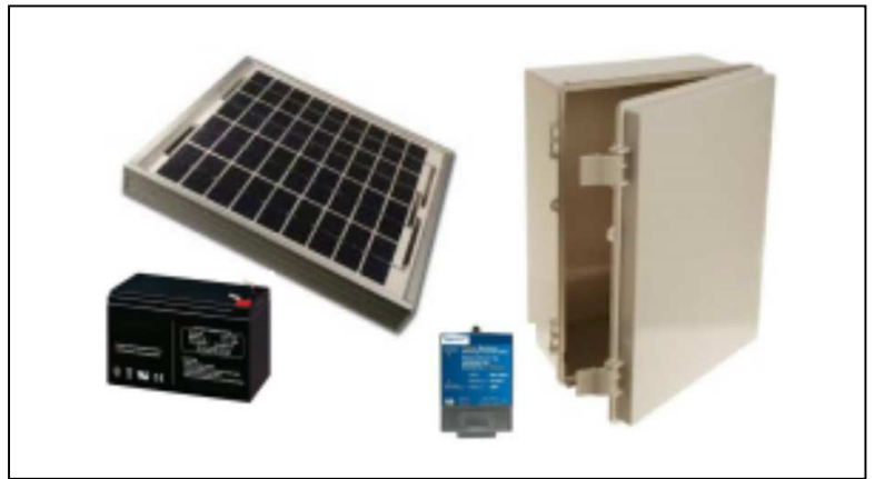
Optional Solar Power System for Switch Transmitter