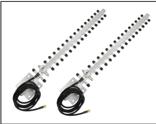
Optional Long Distance Antenna Set