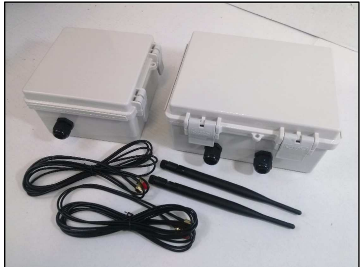
System Features NEMA 4X Rated Enclosures