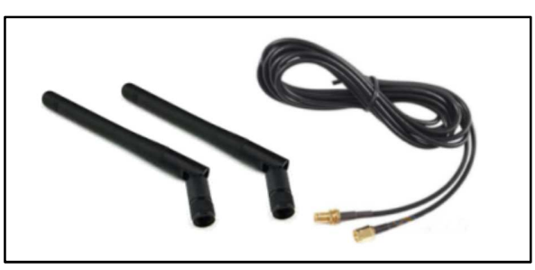
Includes 5dbi Antennas & 9' Antenna Extension Cables

Control Output: Open-collector, 24Vdc, 100mA Max