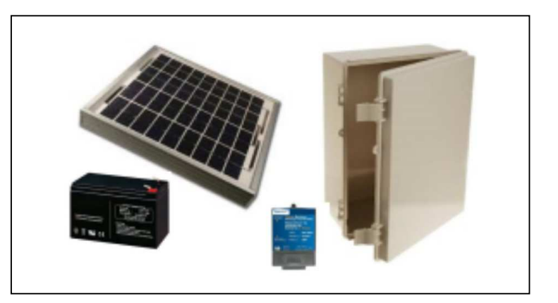
Optional Solar Power Kit

Note: WCS-24 Systems are sold as "Matched Set" Products. You will receive one transmitter unit and one control receiver unit factory programmed to only talk to each other. You can use multiple units in the field within the same area without them effecting each other's operation.