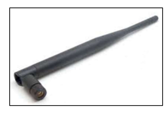
Included 7dbi Antennas