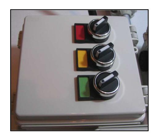
Rotary Switch Version

The WTLBC Series are Multi-color Tower Lights mounted onto a rugged plastic enclosure with wireless operated industrial control switches. Versions are available with an attached switch box or a remote cable between the light assemblies and wireless switch control box. Two different wireless ranges are available with control distances up to 1 mile line-of-sight (LOS). Features include stainless steel mounting brackets, rotary or push-button switches and terminal blocks for power connection. Operating power options are 12V DC or 120V AC