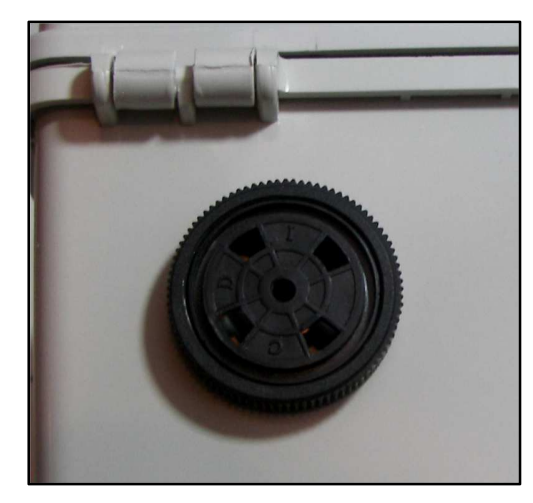
Optional Piezo Alarm Module