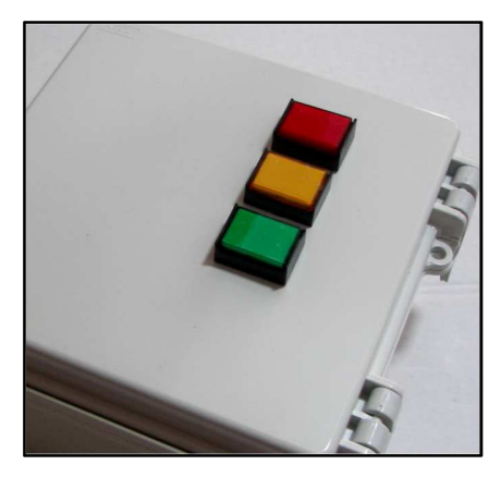
Push-button Switch Version