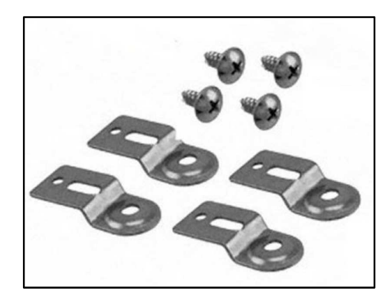
Include Mounting Feet hardware