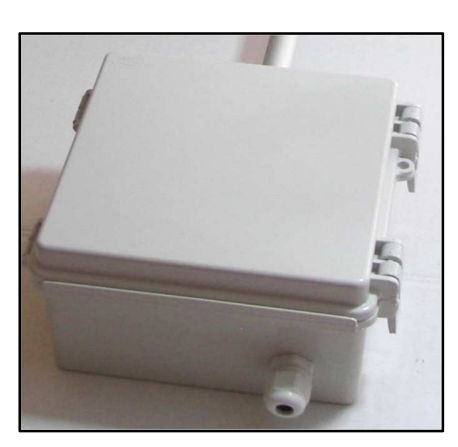
No Switch Version