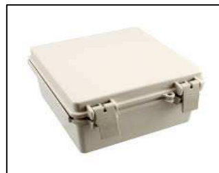
NEMA 4X Enclosure

Optional Lightning/Surge Protection Module Available