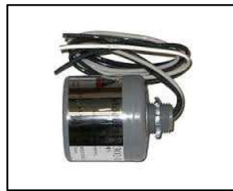
Optional Lightning/Surge Module