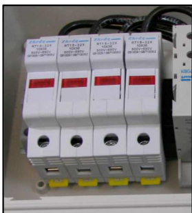
Solar Fuse Holders