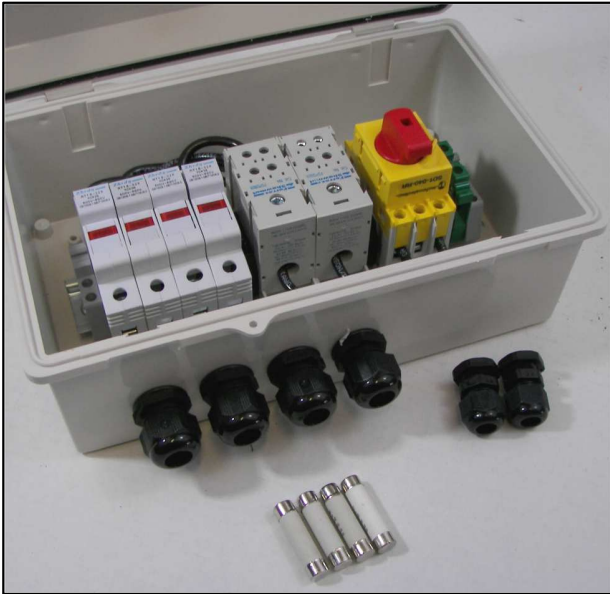
Model SCB-FHDX-4-8A Shown