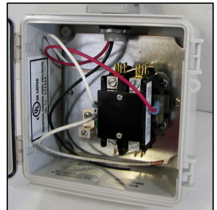
Pre-wired Control Contactor

For Model with Adjustable Angle Sensor add "-AS" to part number. Example: LLCP-20A-2-AS