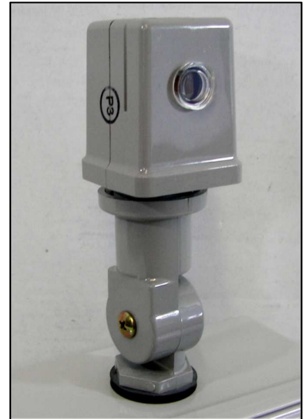
Adjustable Angle Photocell Model