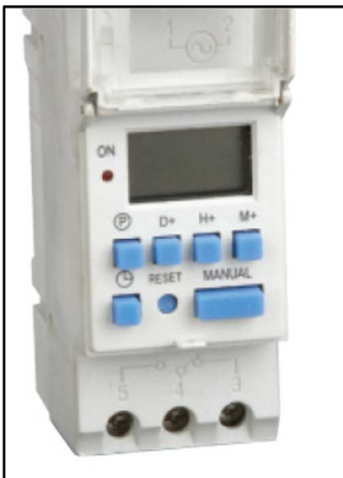
Digital Programmable Timer

Our DTCP-C-120V Series Digital Timer Panels with Control Contactors feature a field programmable 24-hour/7-day digital timer, NEMA 4X weatherproof enclosure and definite purpose contactor. Models are available with 1, 2 or 3-pole contactors that provide 20, 30 or 40 Amp capacity.