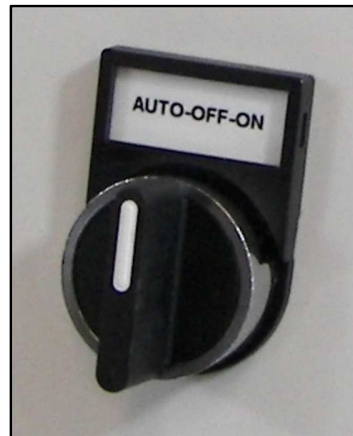
Auto/Off/On Selector Switch