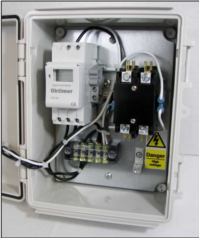
Model DTCP-C-120V-2-30A Shown