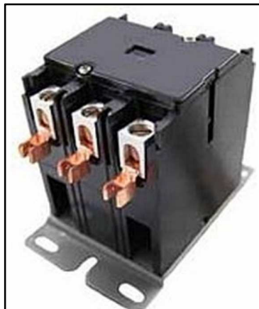
Definite Purpose Contactor