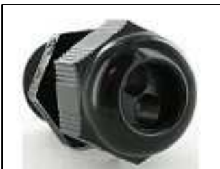
Input/Output Cable Glands

CSCB-CB Series - Compact, Solar Power Combiners feature a weatherproof, non-conductive enclosure. Models are available for 2, 3 or 4 string configuration, 5, 10, 15 or 20 Amp circuit breakers. Circuit breakers are rated for 150 Vdc continuous duty per string.