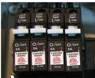
Solar Circuit Breakers